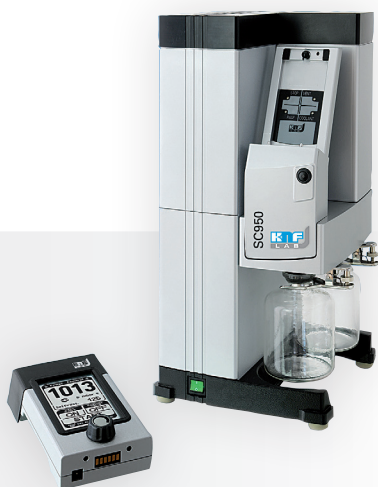
SC 950 w/Wireless Remote Control