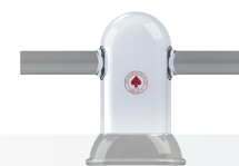
Tube Compression, Twin Right Angle