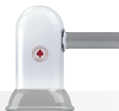
Tube Compression, Right Angle

These adapters feature a ground glass tube sidearm which allows for the attachment of compression fittings. They offer a versatile connection for adapting flexible or rigid tubing. They may also be used for support of probes or other rigid body equipment. The sidearm is used to make tube compression fitting connection to a wide variety of flexible and rigid tubing using our 12709, 12711, 12715 & 12716 product families of fittings.