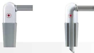
Tube Compression, Right Angle

These adapters feature a ground glass tube sidearm which allows for the attachment of compression fittings. They offer a versatile connection for adapting flexible or rigid tubing. They may also be used for support of probes or other rigid body equipment. The sidearm is used to make tube compression fitting connection to a wide variety of flexible and rigid tubing using our 12709, 12711, 12715 & 12716 product families of fittings.