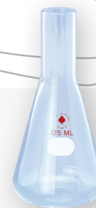
Shaker Flask, No Baffles, w/o Closure