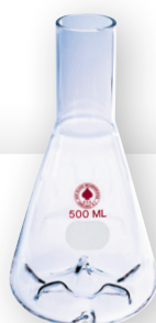
Shaker Flask, 3 Deep Baffles, w/o Closure