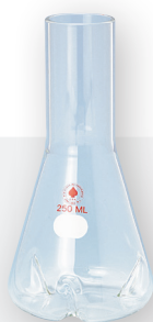
Shaker Flask, 3 Side Baffles, w/o Closure